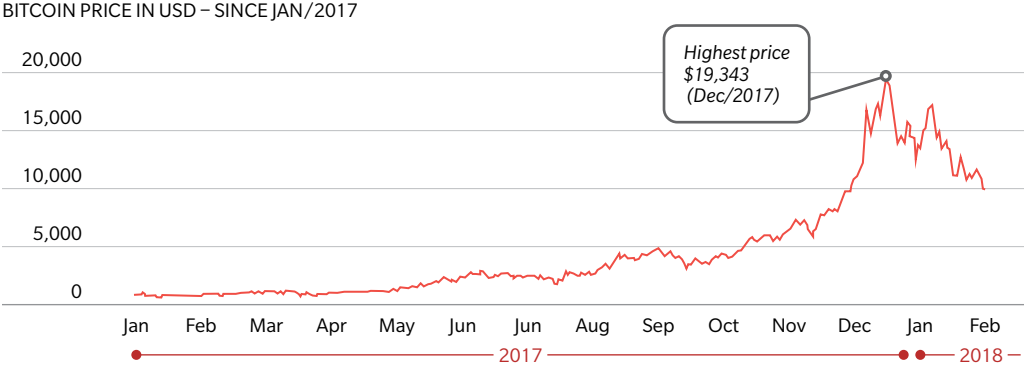
EXHIBIT 3: BITCOIN PRICE IN US DOLLARS

Cryptocurrency prices have been extremely volatile. Bitcoin rose by over 15 times in 2017, and fell by more than 25% in the first month of 2018 (See exhibit 3). 20 Cryptocurrency volatility may likely continue, as many cryptocurrencies limit their monetary supply. When supply is limited, prices will swing with changes in demand. As Bitcoin has shown, demand for cryptocurrencies can be highly variable leading to extreme price volatility.