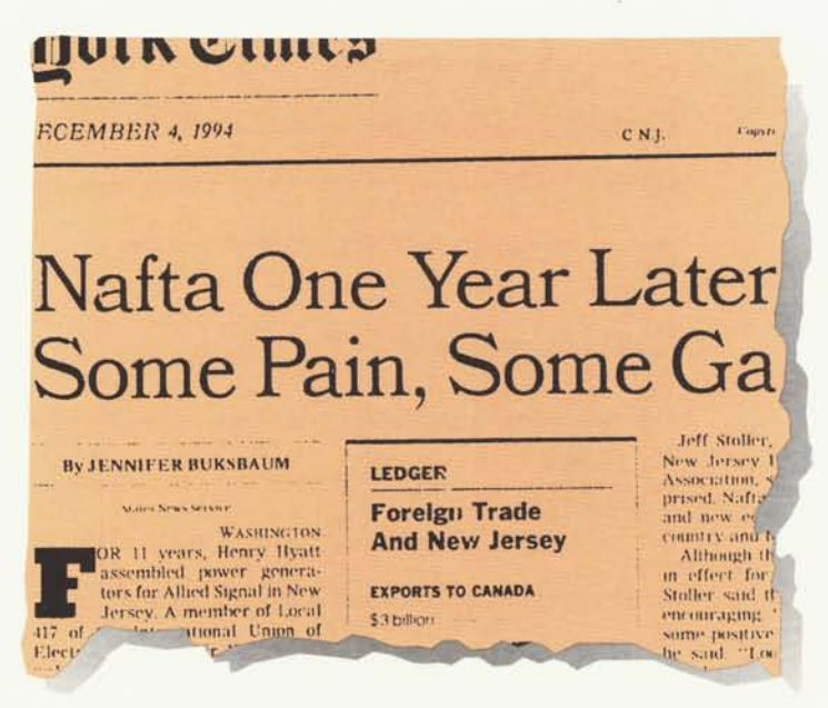
© THE NEW YORK TIMES, 12/4/94

TO BE SURE, THE FORCES OF GLOBALIZATION HAVE HAD THEIR