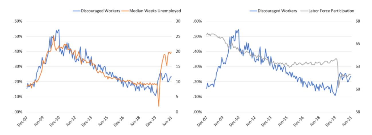
Chart 3. Median Weeks Unemployed and Discouraged Workers/Discouraged Workers and Labor Force Participation Rate