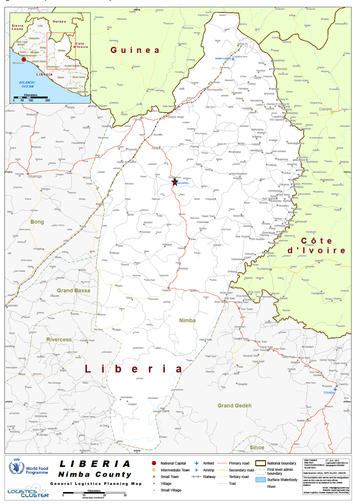
Figure 1. Map of Nimba County